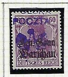
60 f magenta