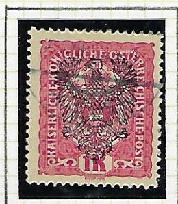
1k red on yellow (overpr. black)