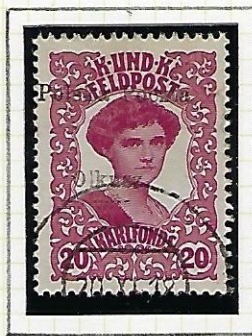
20h reddish pale violet Empress Zita