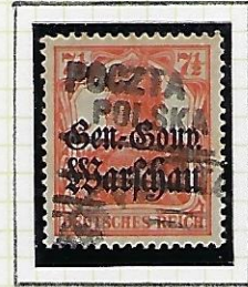
7 1/2 f orange