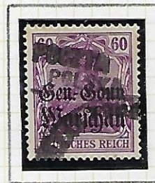
60 f magenta