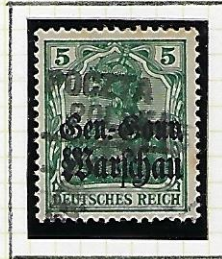
5 f green