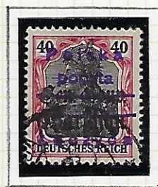
40f black and