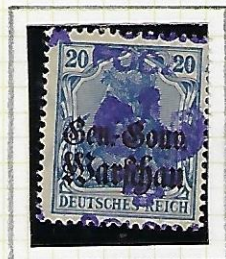
20 f Prussian blue