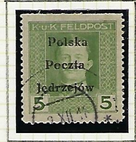
5h golden green