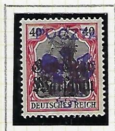
40 f black and carmine.