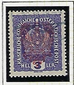
3h violet (overpr. red)

15 stamps, in values of 3 h(alerzy) to 1 k(rona). Issue known as " TARNÓW I ".