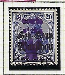
20f violet-blue (German overprt mat, dull)