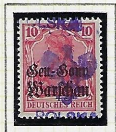
10 f carmine