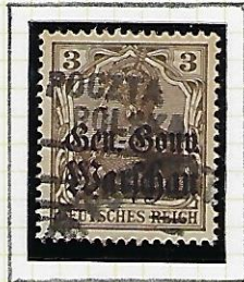
3 f brown