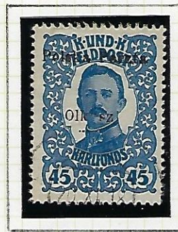
45h blue Emperor Charles

Overprinted "Poczta Polska / Olkusz" instead of "Polska Poczta / Olkusz".