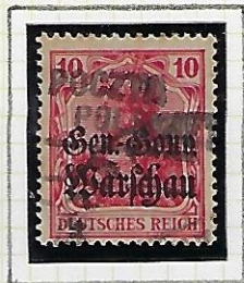
10 f carmine