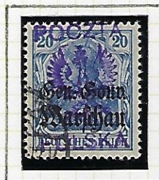
20f Prussian blue