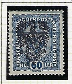
60h dark blue (overpr. black)