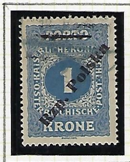
1 k blue Overprint II plus horizontal line to cancel "PORTO" on the Austrain stamp, changing it into a Polish ordinary pos- tage stamp.

One stamp, in the value of 1 korona only. Type "TARNÓW II(b)".