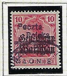
10 f carmine