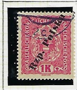
1k red on yellow