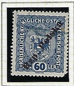
60h dark blue