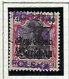
40f black and carmine