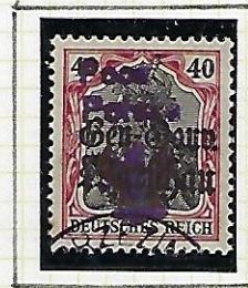
40f black and carmine (German overprt.. mat, dull).