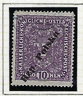
10k bright violet