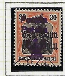
30f orange and black