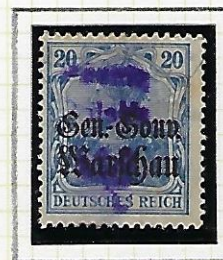
20f pale blue (German overprt, phosphoreous)