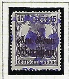
15 f slate-violet