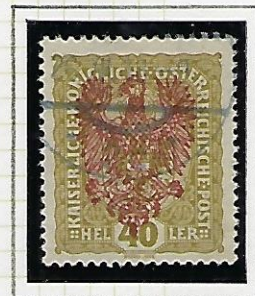
40h olive (overpr. red)