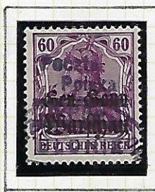
60 f magenta