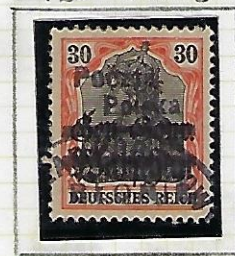
30 f orange and black