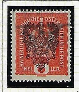
6h orange (overpr. black)