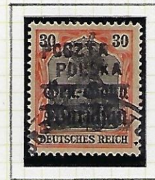
30f black and orange/buff