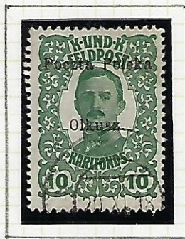
10h green Emperor Charles