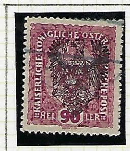
90h red-violet (overpr. black)