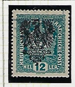
12h green-blue (overpr. black)