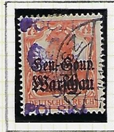
7 1/2 f orange