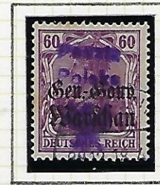
60f blackish lilac (German overprt.. mat, dull).