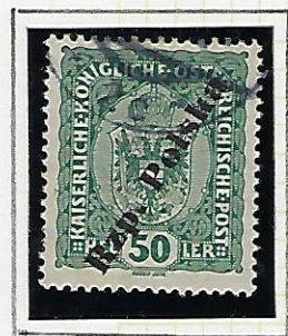
50h darg green