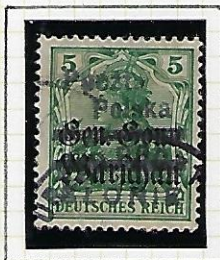
5 f green