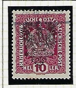
10h carmine-violet (overpr. black)