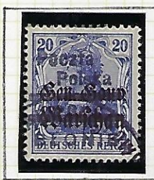
20 f pale blue (German ovrpt. sulphureous)