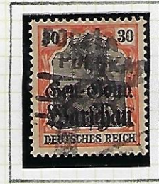
30 f black and orange/ buff