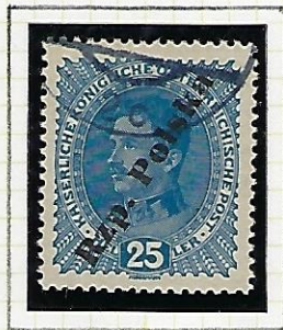
25h dark blue