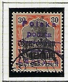
30f black and orange/buff