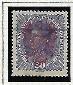
30h violet (overpr. red)