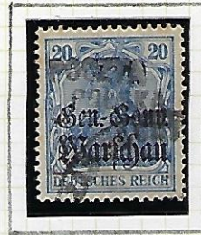
20 f blue