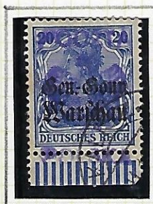
20 f ultramarine