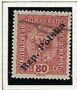
80h reddish brown