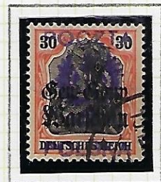
30f black and orange/buff.