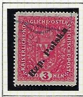
2k light blue