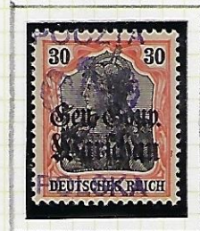
30 f black and orange/buff.