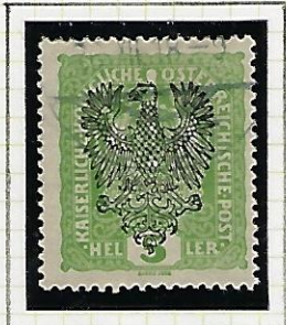
5h yellow-green (overpr. black)