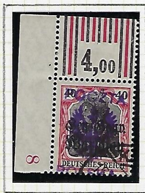
40f black and carmine.