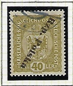
40h olive Overprint inverted (authentication mark Ø on back)

1919: Stamp of Austria over- printed "Rzp. Polska" in a single diagonal line, plus a horizontal line to cross out the word "PORTO".