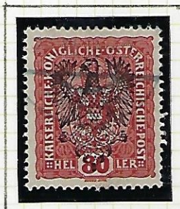
80h reddish brown (overpr. black)