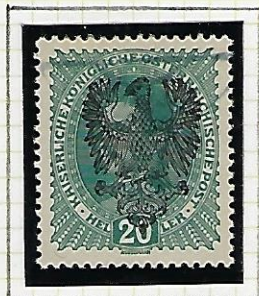
10h blue-green (overpr. black)