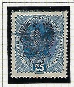
25h dark blue (overpr. black)