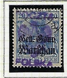
20f Prussian blue