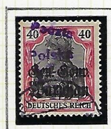
40f black and carmine (German ovpt. shiny)