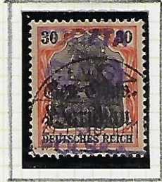
30f black and orange/buff