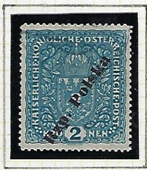
3k light carmine