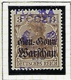
3 f brown