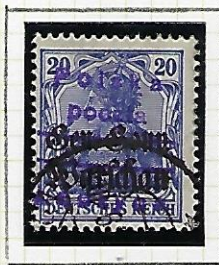
20f Prussian blue