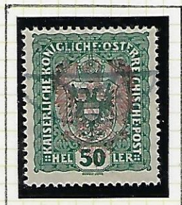
50h dark green (overpr. red)