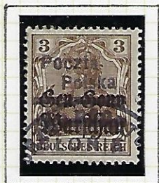
3 f brown