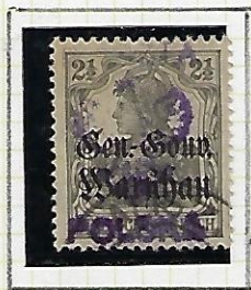
2½f grey OEF 30.1.98 K. 110. 20. (No exp., but post mk. KALISZ).

Known as Type " KALISZ II ". Surcharge handstamped in violet , with the so-called "Narrow Eagle", using rubber stamp. Un-official (but tolerated) issue.