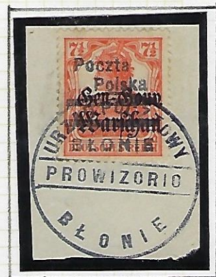
7 1/2 f orange