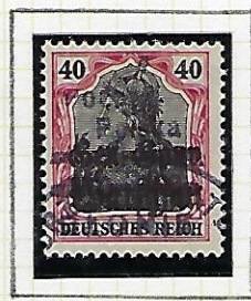
40 f black and carmine