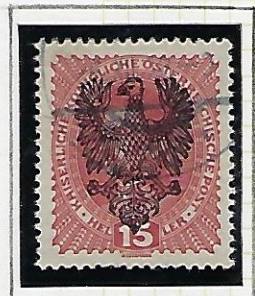
15h brown-red (overpr. black)