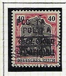
40f black and carmine