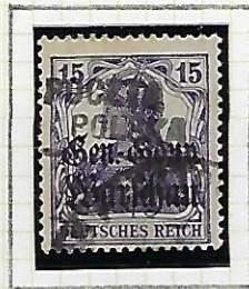
15 f slate-violet