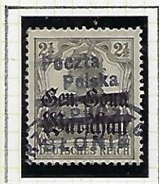
2 1/2 f grey

Manually-stamped overprint in violet, black-blue, or black. Overprint size: 17.5 x 17.5 mm . Known to be produced with philatelic correspondence. Un-official , but tolerated by Post.