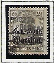
2 1/2 f grey

Overprints handstamped in black and in red, using rubber stamps producing ovpt. size 17.5 x 17.5 mm. Known to have been produced for philatelic purposes. Un-official , but tolerated.