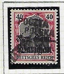
40 f black and carmine