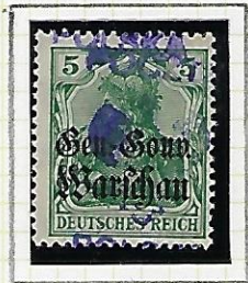
5 f green