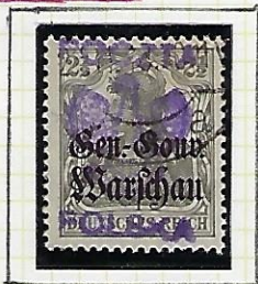
2½f bright grey