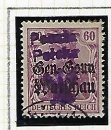
60f bright lilac (German ovprt sulphureous)