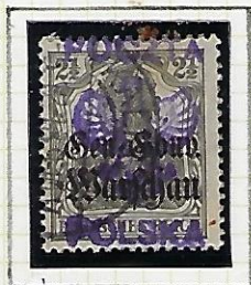
2 1/2 f grey