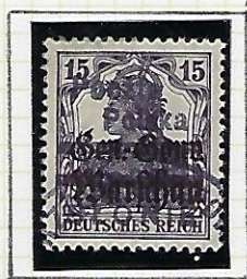
15 f slate-violet